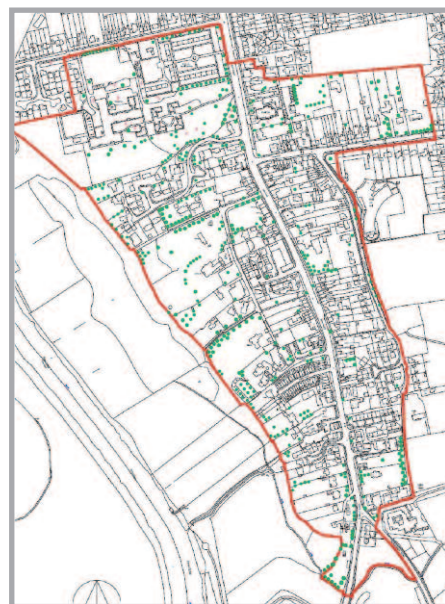
The conservation area, marking prominent trees – from St Oswald's road in the north to the Stone Bridge area at the south

Carrying out tree works without permission can lead to a fine of up